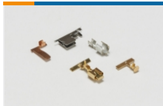
Special Purpose Terminals(1)